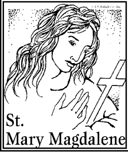
St. Mary Magdalene