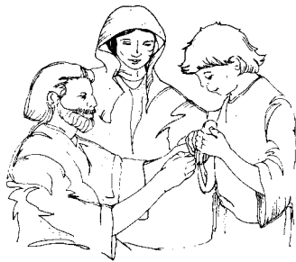
The Child grew and became strong